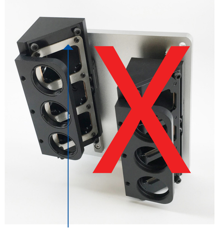
Incorrect. Dichroic cover facing outside.