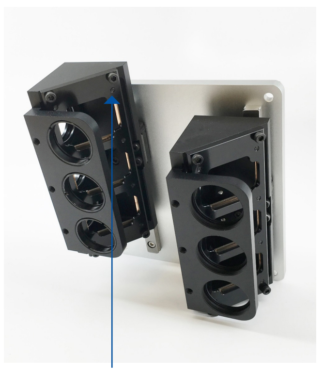
Correct. Dichroic cover facing inside.